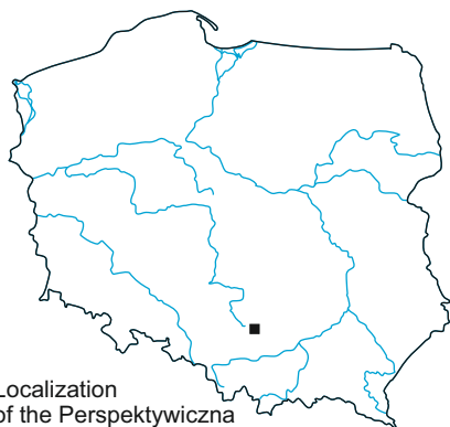
Localization of the Perspektywiczna Cave on a map of Poland

Since 2012 the sediments were explored in four archaeological trenches. Trench „V” is the main excavation area explored during 2013-2014-2015 campaigns, and is an extension of the test trench digged in 2012. Three other trenches were only explored during 2013 season.