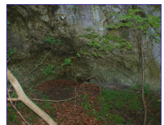
▲ Perspektywiczne Shelter - a part of Perspektywiczna Cave karst system - as seen from north on May 3rd, 2012, during a programme of geological survey in the rockshelters situated in the Udorka and Wodaça valleys by M.T. Krajcarz, M. Sudoł and M. Krajcarz, before the start of the first excavation season. An entrance of tunnel connecting the shelter and the main cave is visible in a centre.